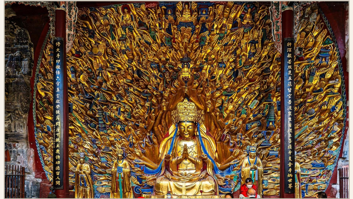
Dazu Rock Carvings (UNESCO)

Need help choosing the best route? See my latest Chongqing route ideas: eliaschongqing.com