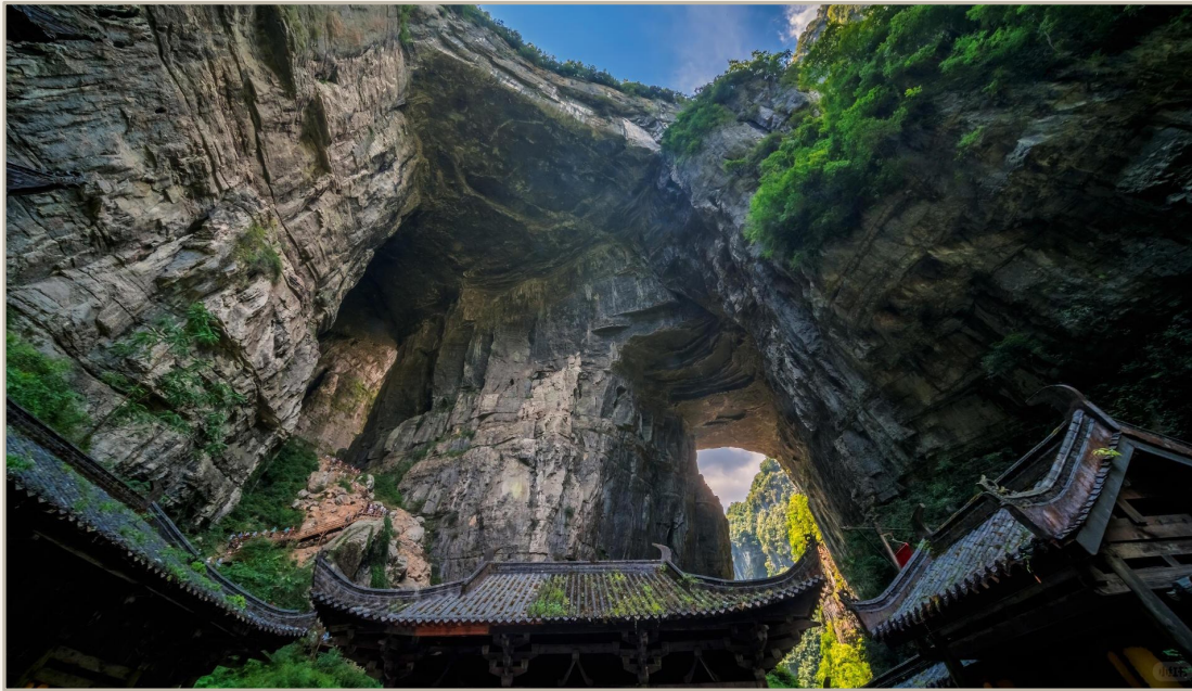
Wulong Karst National Geology Park (UNESCO)

2 days: central city. 3 days: add Wulong or Dazu. 4-5 days: a slower pace with both side trips.